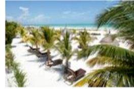
Beach at the CasaSandra Boutique Hotel.