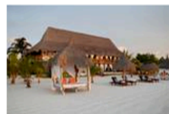
CasaSandra Boutique Hotel, Isla Holbox, Mexico

CasaSandra is a chic, 20-suite beachfront retreat located in the remote fishing village of Holbox Island north of Cancun , where the Caribbean Sea meets the Gulf of Mexico. Remote yet easy to access, the hotel is a low-key sanctuary with streets made of sand, thatched daybeds, and shady palms. It's a magnet for romantics, off-beat travelers, and nature lovers.